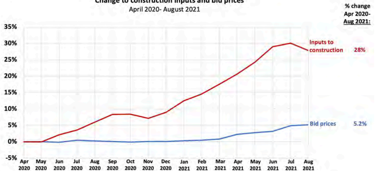
Change to construction inputs and bid prices April 2020- August 2021